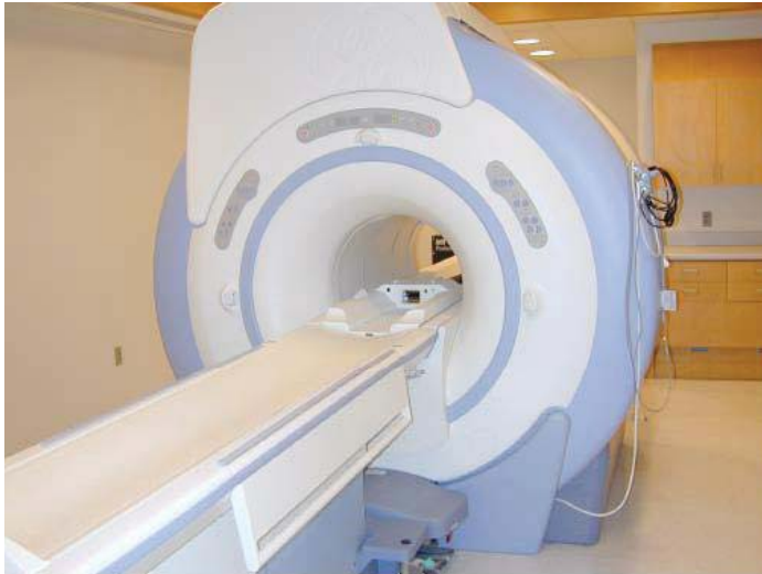
*Figure 1. The 3-Tesla MR system located at University Hospital, University of Southern California, Los Angeles, CA.

that the sprinklers and associated components are not intended for use inside of or close to the bore of an MR scanner (See Figure 1). Accordingly, the method of testing and the measurements obtained must represent worst-case scenarios and determine the level of magnetic field interactions relative to the intended use of the object.